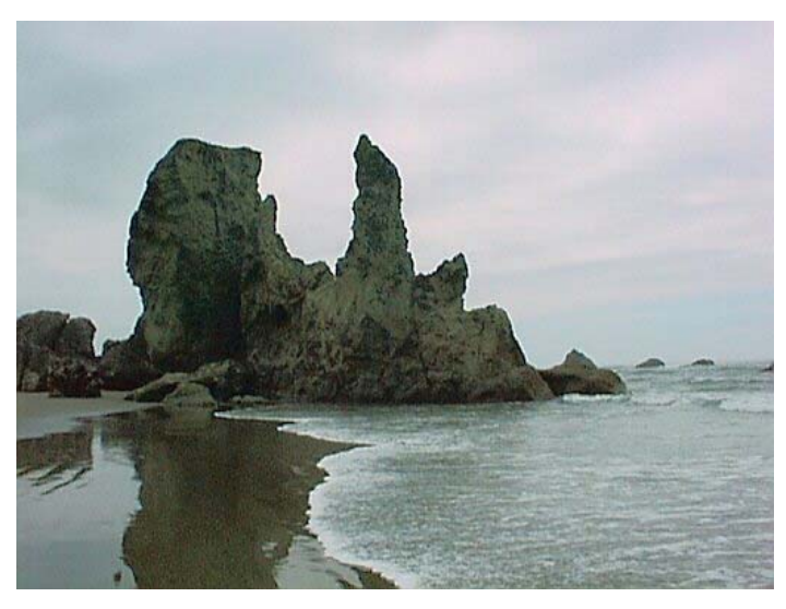
Wind Over Water