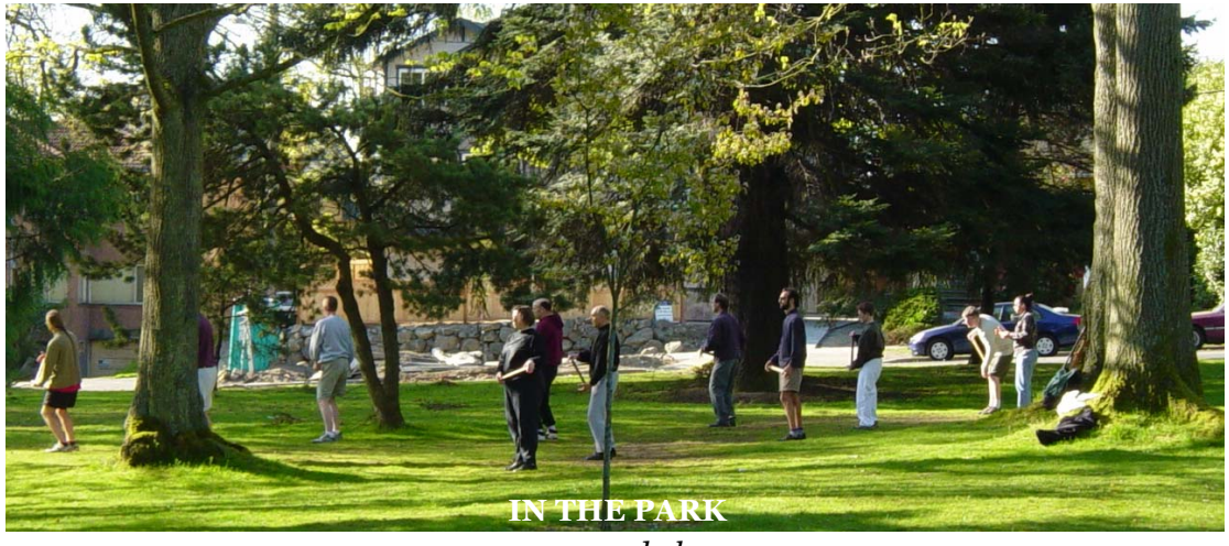
come and play

Weather permitting all classes will now be in the park. If you have an evening free come and practice during the ongoing classes. Or, for the summer, schedule an extra evening of practice and watch what the other classes are up to.