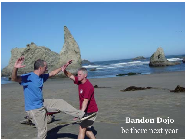
Bandon Dojo be there next year

Clearly distinguish each movement. Bagua song