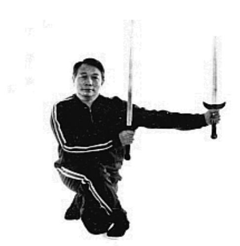
"Pretty Queen's Double Sword Dance", Tai Chi Double Sword